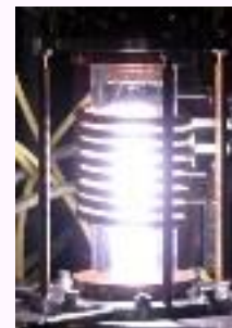
Induction thermal plasma for materials processing