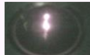
Non-thermal plasma applications